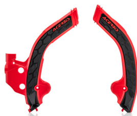
Red/Black code: 24290.349