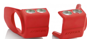
Red code: 23680.110