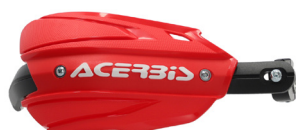
Red/White code: 25486.343