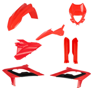
Original code: 25461.553 RR Models