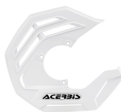
White code: 24328.030 X-Future