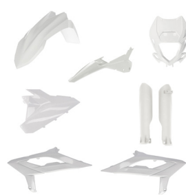
White code: 25461.030 RR Models