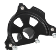
code: 25361 & 25022 Black