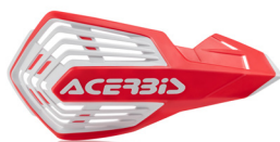
Red/White code: 24296.343