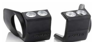
Black code: 23680.090