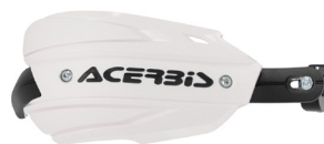
White code: 25486.237