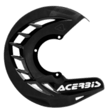
Black code: 16057.090 X-Brake