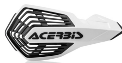
White/Black code: 24296.237