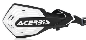
Black/White code: 25960.315