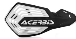
Black/White code: 24296.315