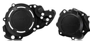
Black code: 23763.090