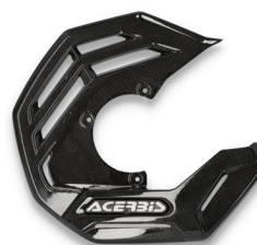
Carbon code: 24579.070 X-Future Carbon