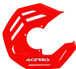
Red code: 24328.110 X-Future