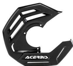
Black code: 24328.090 X-Future