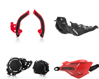
code: ABB.RR250300.20 RR 250/300 20-24