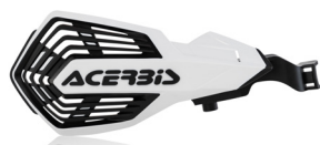
White/Black code: 25960.237