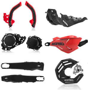
code: AB.RR250300.20 RR 250/300 20-24