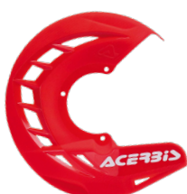
Red code: 16057.110 X-Brake