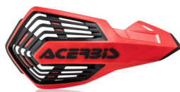
Red/Black code: 24296.349