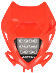
Red code: 25033.110 RR Models