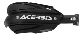
Black code: 25486.315