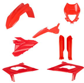
Red code: 25461.110 RR Models