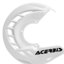
White code: 16057.030 X-Brake