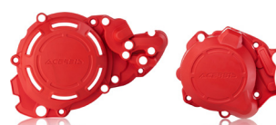
Red code: 23763.110