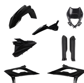
Black code: 25461.090 RR Models