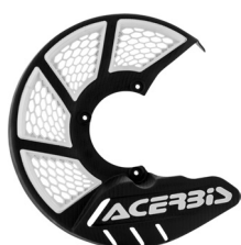
Black/White code: 21846.090 X-Brake 2.0