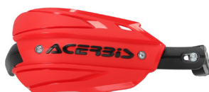
Red/Black code: 25486.349