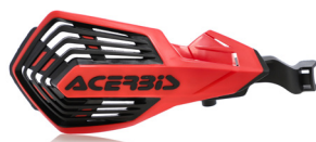
Red/Black code: 25960.349