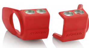
Red code: 23197.110