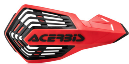
Red/Black code: 24296.349