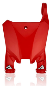
Red code: 298182.110