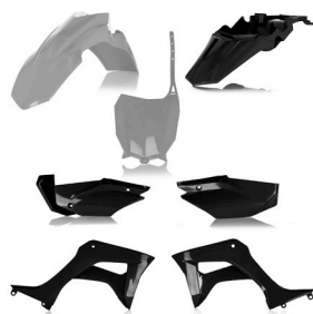
Grey/Black code: 24606.293 CRF 110 Models