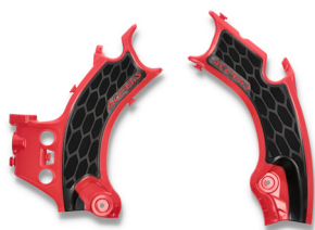
Red/Black code: 24715.349