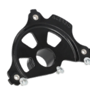
code: 25014 Black