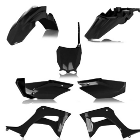
Black code: 24606.090 CRF 110 Models