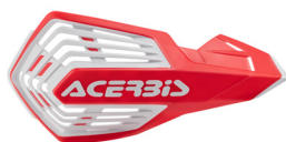
Red/White code: 24296.343