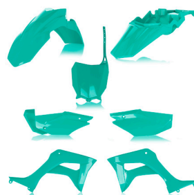
Teal code: 24606.133 CRF 110 Models