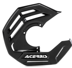
Black code: 24328.090 X-Future