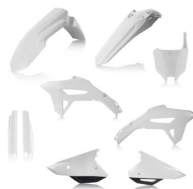
White/Black code: 24559.237 CRF Models