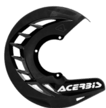
Black code: 16057.090 X-Brake