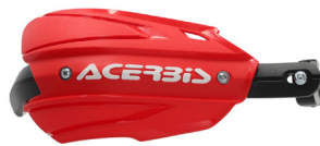
Red/White code: 25486.343