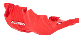
Red code: 25034.110