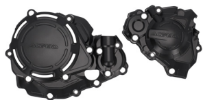
Black code: 24688.090