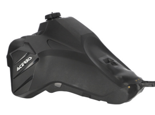
Black code: 25116.090 25 Litre Africa Twin 1100L Models