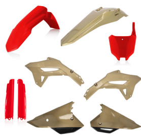
Red/Gold code: 24559.350 CRF Models