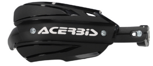
Black code: 25486.315