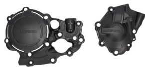
Black code: 25028.090