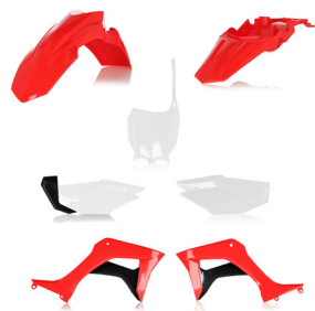
Original code: 24606.553 CRF 110 Models