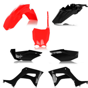
Red/Black code: 24606.349 CRF 110 Models