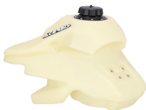
Black code: 24756.090 11 Litre CRF Models