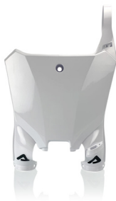
White code: 298182.030