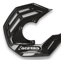
Carbon code: 24579.070 X-Future Carbon