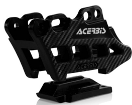
Black code: 17949.090