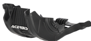
Black code: 25034.090