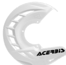
White code: 16057.030 X-Brake