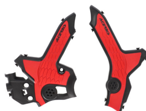
Black/Red code: 25127.323