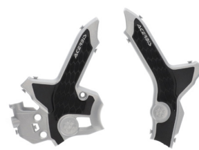
Silver/Black code: 25127.293