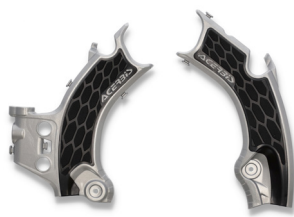
Silver/Black code: 24715.223