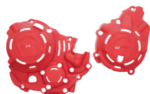
Red code: 25940.110