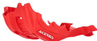
Red code: 24705.110