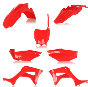
Red code: 24606.110 CRF 110 Models