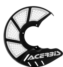
Black/White code: 21846.090 X-Brake 2.0