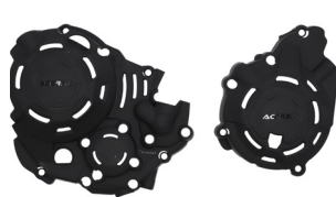
Black code: 25940.090