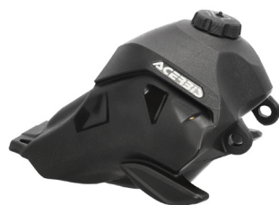
Black code: 25114.090 14 Litre CRF 300L Models