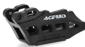
Black code: 24815.090