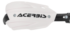
White code: 25486.237