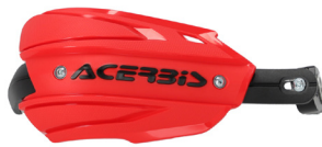
Red/Black code: 25486.349