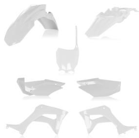
White code: 24606.030 CRF 110 Models