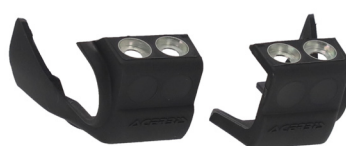
Black code: 25964.090