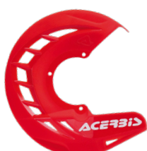
Red code: 16057.110 X-Brake