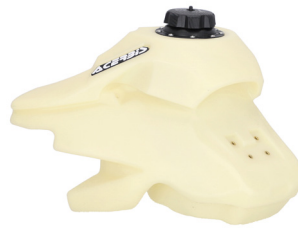
Black code: 24758.120 11 Litre CRF 450RX Models