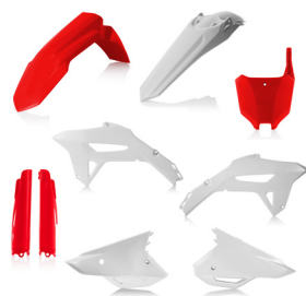
Red/White code: 24559.343 CRF Models