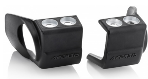
Black code: 23197.090