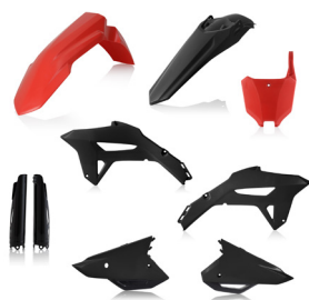
Red/Black code: 24559.349 CRF Models