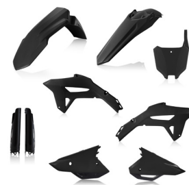
Black code: 24559.090 CRF Models