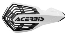
White/Black code: 24296.237