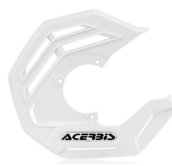
White code: 24328.030 X-Future