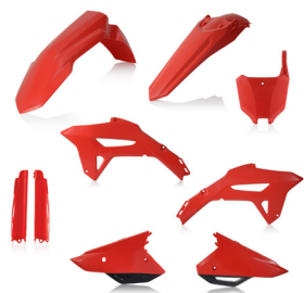
Original code: 24559.553 CRF Models