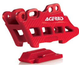
Red code: 17949.110