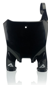
Black code: 298182.090