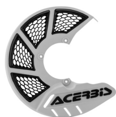
White/Black code: 21846.030 X-Brake 2.0