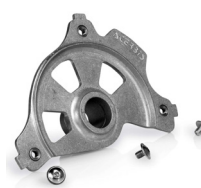
code: 20081 Silver