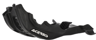
Black code: 24705.090