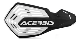
Black/White code: 24296.315