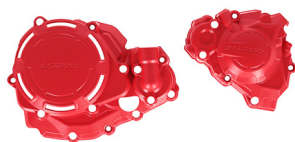
Red code: 24688.110