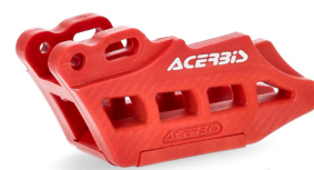
Red code: 24815.110