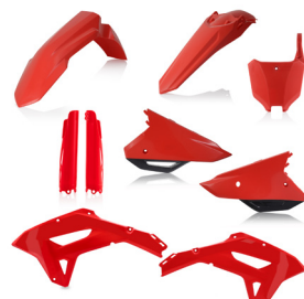
Original code: 24582.553 CRF 450X Models