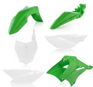
Original code: 23996.553.700 KLX 110 Models

NOTE: Individual Plastics are available for this Model