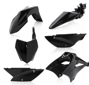
Black code: 23996.090.700 KLX 110 Models