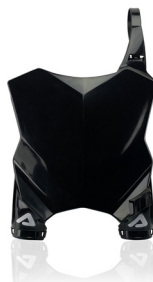
Black code: 298184.090