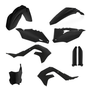
Metallic Black code: 23649.092 KXF 250 Models