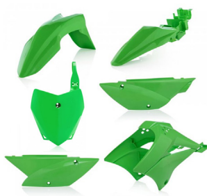
Green code: 23996.130.700 KLX 110 Models