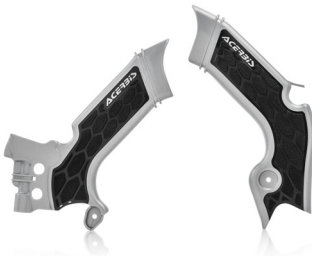
Black/Grey code: 23693.293