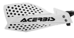
White/Black code: 22115.237