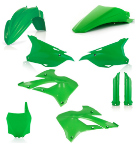
Green code: 24923.130 KX 85 Models