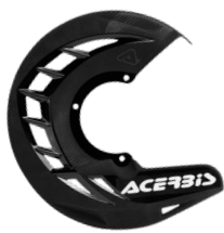
Black code: 16057.090 X-Brake