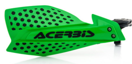
Green/Black code: 22115.377