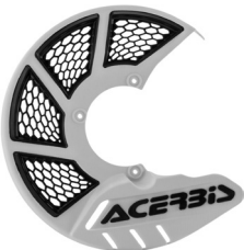
White/Black code: 21846.030 X-Brake 2.0