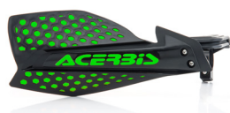
Black/Green code: 22115.325