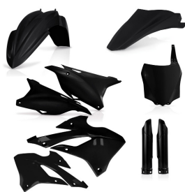
Black code: 24923.090 KX 85 Models