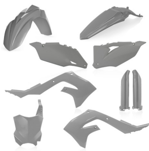
Grey code: 23649.070 KXF 250 Models