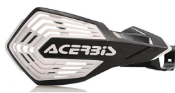
Black/White code: 24660.315