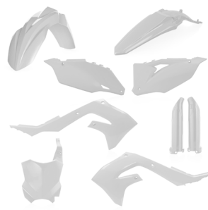
White code: 23649.030 KXF 250 Models