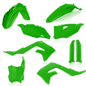
Green code: 23649.130 KXF 250 Models