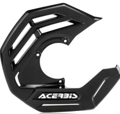
Black code: 24328.090 X-Future