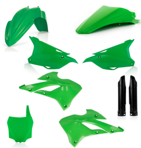
Original 22 code: 24923.553 KX 85 Models