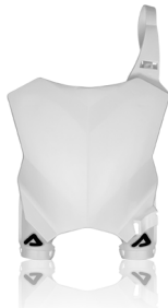
White code: 298184.030