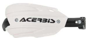
White code: 25486.237