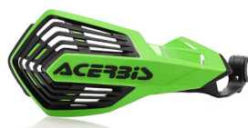
Green/Black code: 24660.377