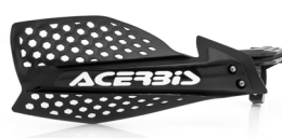
Black/White code: 22115.315