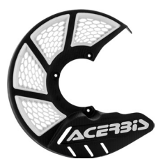
Black/White code: 21846.090 X-Brake 2.0