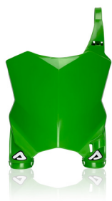
Green code: 298184.130