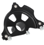
code: 25019 Black