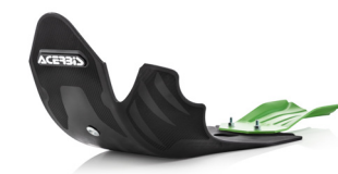
Black/Green code: 23701.325