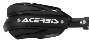
Black code: 25486.315