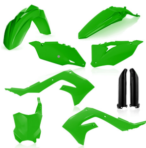
Original 20 code: 23649.553.020 KXF 250 Models

NOTE: Individual Plastics are available for this Model