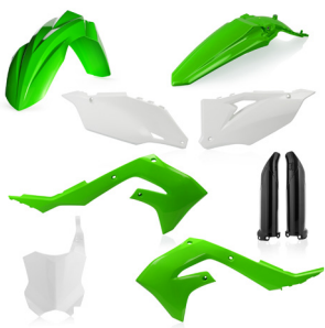
Original code: 23649.553 KXF 250 Models