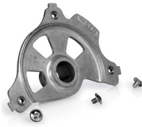
code: 23663 Silver