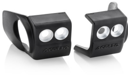
Black code: 23197.090