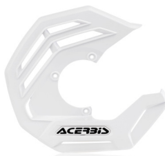
White code: 24328.030 X-Future