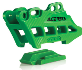
Green code: 17950.130