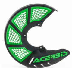
Black/Green code: 21846.325 X-Brake 2.0