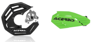
code: ABB.KXF250450.19 KXF 250 21-24