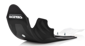
Black/White code: 23701.315