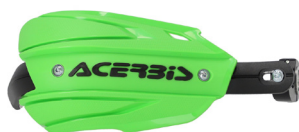
Green code: 25486.377