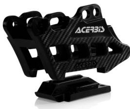
Black code: 17950.090