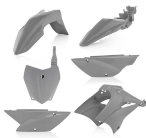
Grey code: 23996.070.700 KLX 110 Models