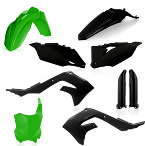
Green/Black code: 23649.325 KXF 250 Models