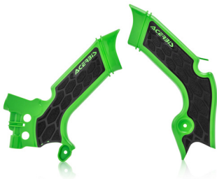
Green/Black code: 23693.377