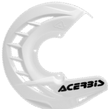
White code: 16057.030 X-Brake