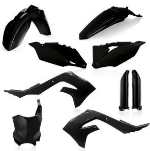
Black code: 23649.090 KXF 250 Models