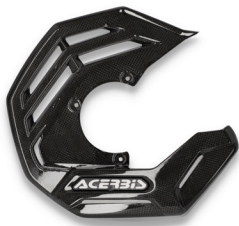
Carbon code: 24579.070 X-Future Carbon