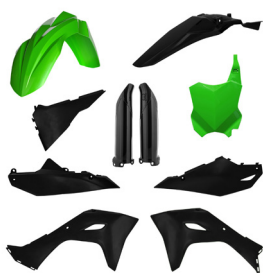
Original code: 26078.325 KXF 450 Models